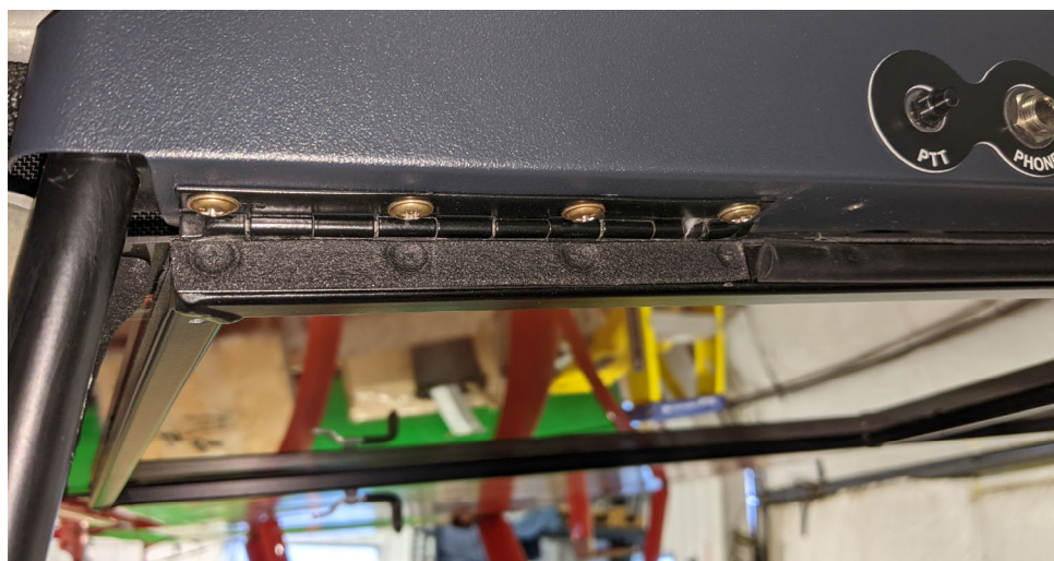
FIGURE 5 – Foam Seal on Window Hinges