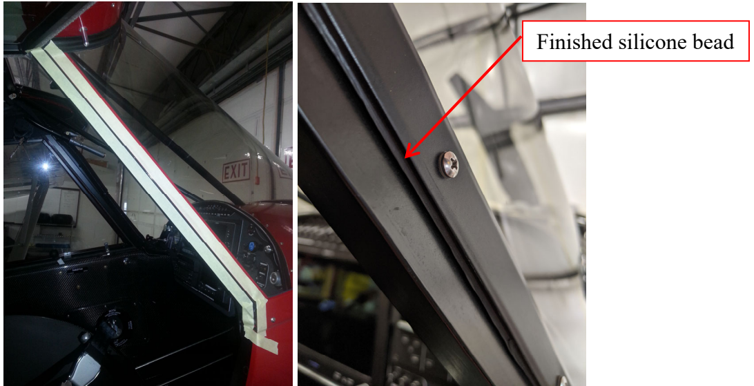
FIGURE 6 – Silicone Seal