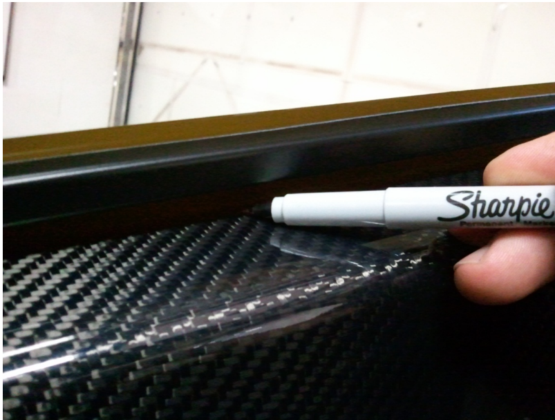
FIGURE 2 – Window Marking