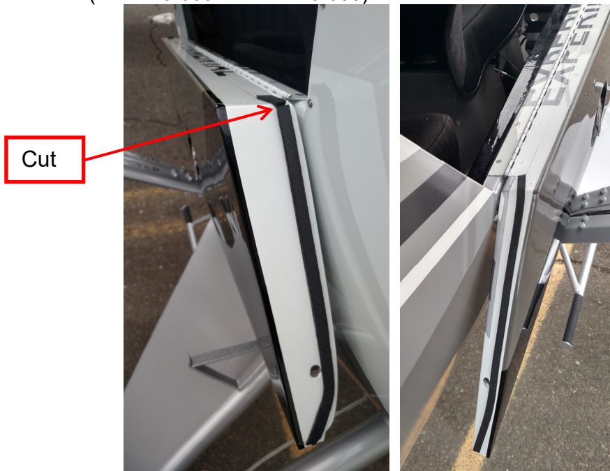
FIGURE 1 – Foam Seal on Door