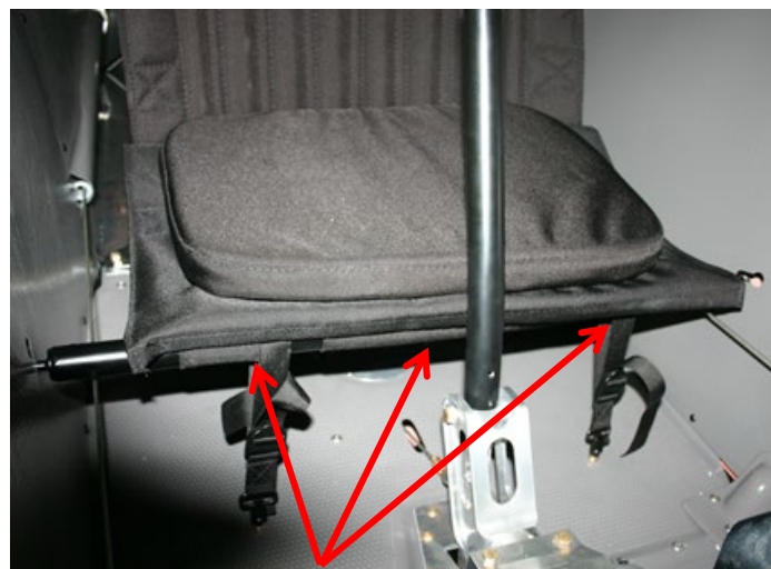
FIGURE 1 – Aft Sling Seat