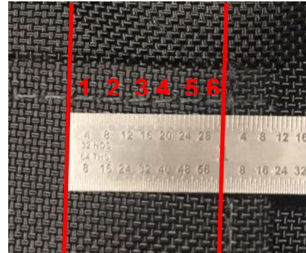
FIGURE 3 – Six Stitches Per Inch