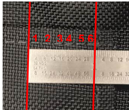
FIGURE 3 – Six Stitches Per Inch