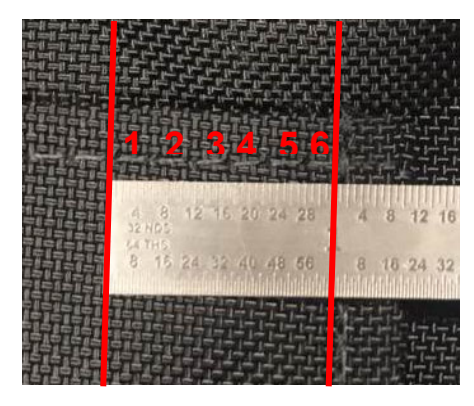
FIGURE 3 - Six Stitches Per Inch