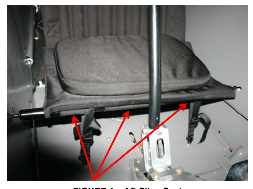
FIGURE 1 – Aft Sling Seat