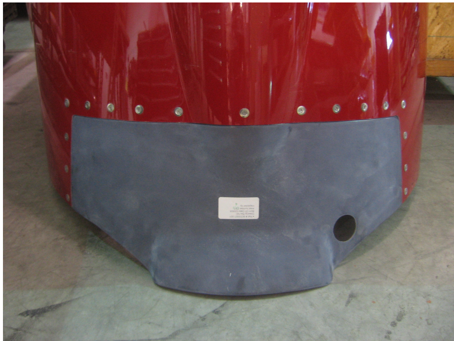
FIGURE 2 – APPROXIMATE HOLE/SCREW LOCATIONS