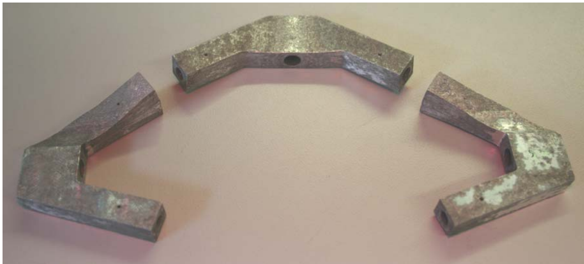
FIGURE 1 – Corroded Parts