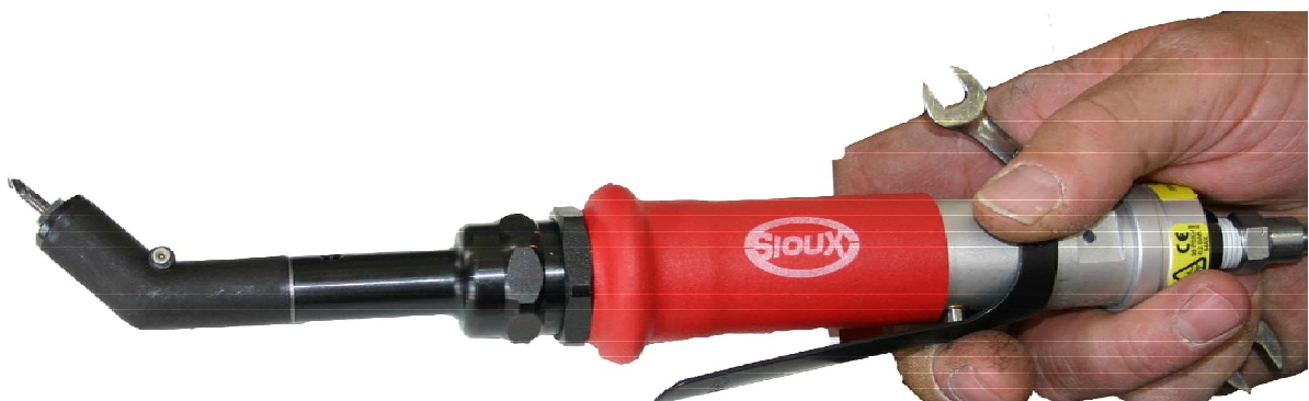
Figure 3: Example of suitable drill