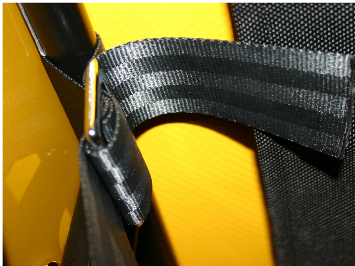
Figure 1 - Strap Routing around Fuselage Tube