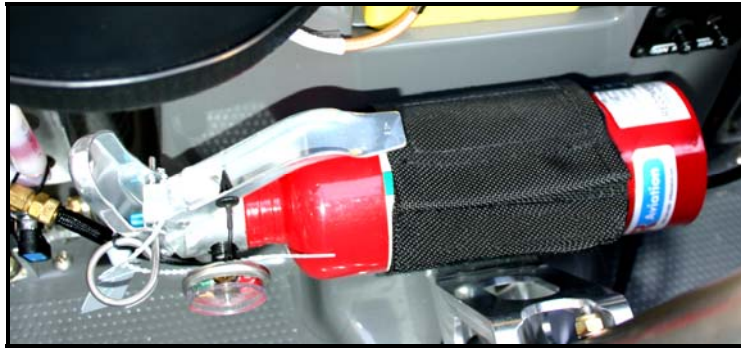
FIGURE 2 – Correct Fire Extinguisher Installation