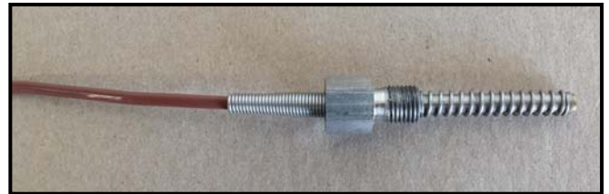
FIGURE 2 – New EI P-101 Grounded CHT Probe, Screw In Type