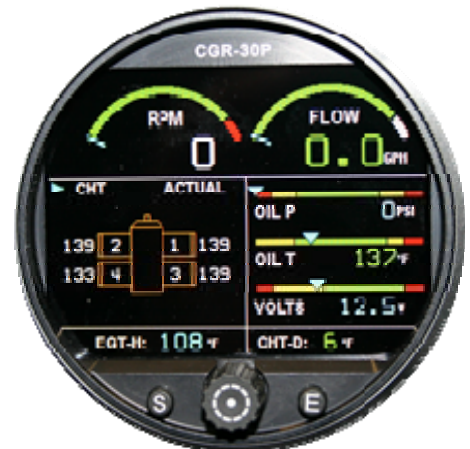
FIGURE 3 - CGR-30P Engine Monitor

If you are no longer in possession of this aircraft, please forward this information to the present owner/operator and notify Cub Crafters, Inc. Contact the customer service department at: