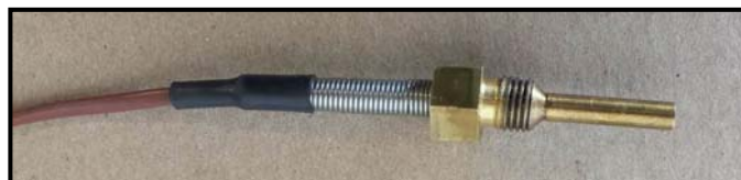
FIGURE 1 – EI P-100 Ungrounded CHT Probe